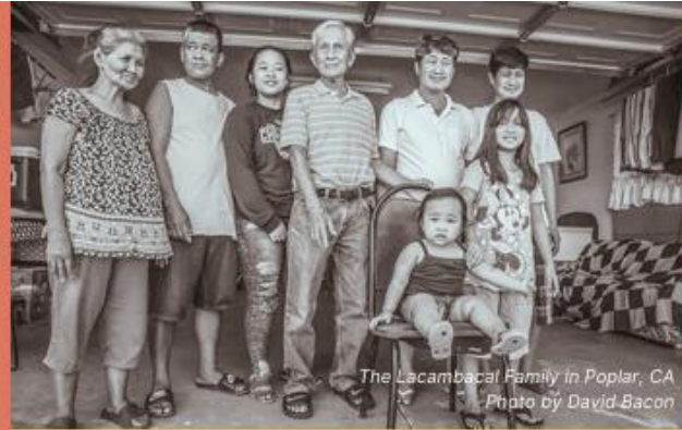
The Lacambal Family in Poplar, CA