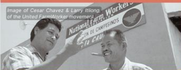
Image of Cesar Chavez & Larry Itliong, of the United Farm Workers movement